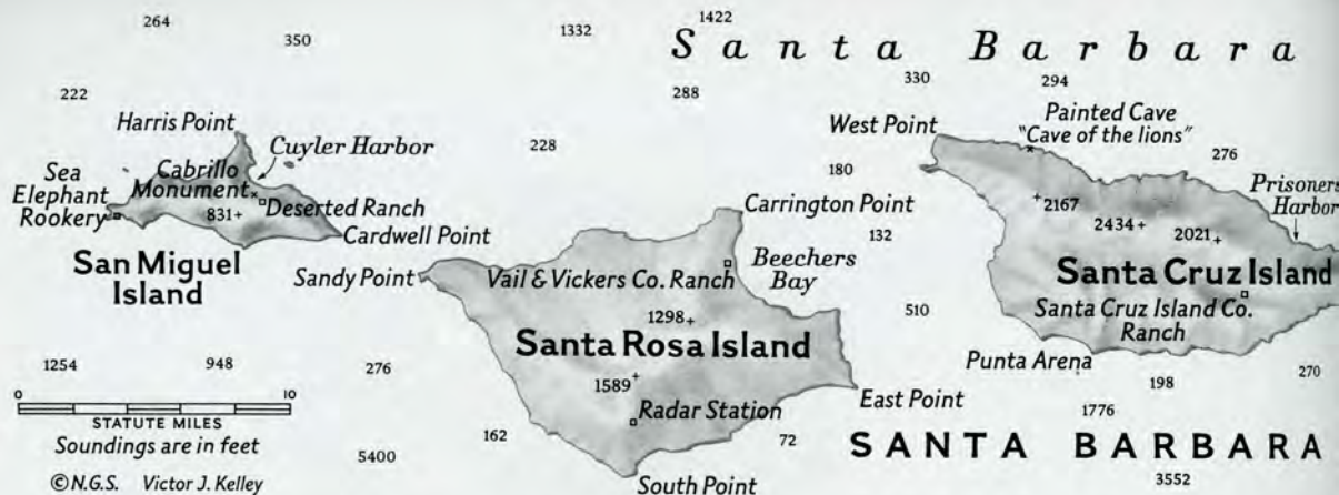
Mountaintops Jutting out of the Pacific Form California's Channel Islands; Only

California coast, left ancestors of these animals on the larger offshore islands as a possible food supply.